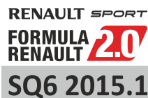
ECU release 2015.1 sticker

All FR2.0 ECUs must be reprogrammed by Renault Sport Technologies for the 2015 season with these new ECU software and mapping, release called 2015.1 , following the program schedule detailed later on. The reprogrammed ECU will then be identified by the related sticker as shown below