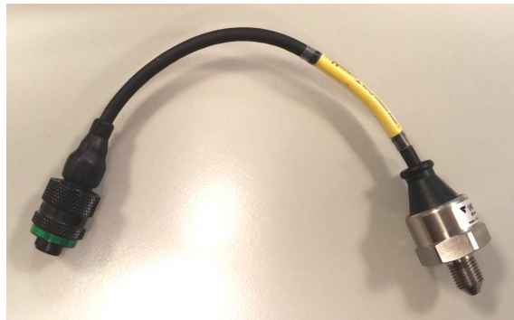
Engine oil pressure evo 2015 ref :77 11 166 922

A new ECU software has been released for the coming season in order to improve the ECU reliability and the engine management. It includes a new mapping for a new engine oil pressure sensor, which provides better measurement accuracy and consistency,